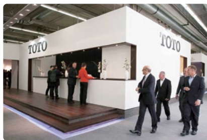
Exhibiting at the ISH trade fair for housing equipment, held in Germany

TOTO was born 100 years ago when our founder was exposed to advanced lifestyles overseas. Now, we are the ones proposing new lifestyles to people around the world. We always respect the lifestyles of each land we enter and enable local production with a sales system that is suitable for that region. TOTO's exceptional environmental technology is receiving recognition in many countries worldwide. We are also viewed as a high-end luxury brand in certain areas. No matter what the country or region, we aim to be recognized as the number one brand. We believe that is what it means to be a "truly global company."