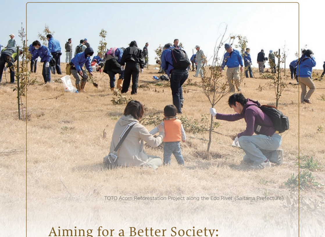
TOTO Acorn Reforestation Project along the Edo River (Saitama Prefecture)