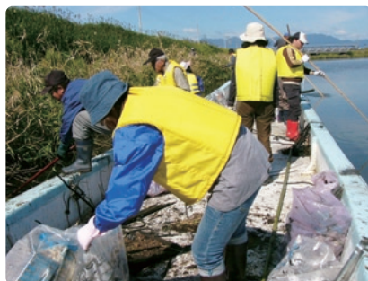
TOTO Water Environment Fund's river cleanup activities with the Yanamune River Watershed Sightseeing Boat

The TOTO Water Environment Fund was established in 2005 to help non-profit organizations (NPOs) and civic groups with their water-conservation efforts. Every year, we take a greater role in supporting these organizations by encouraging TOTO Group employees to participate in volunteer activities and share information. These actions create new channels of interaction between TOTO and such groups. Further, to celebrate 90 years in business, we started the TOTO Acorn Reforestation Project in fiscal 2006. TOTO Group employees pick up acorns, nurture them at the plant or their homes, and return the saplings to the forest with help from the local community. Participants also regularly cut the grass so the acorn trees have enough space to grow.