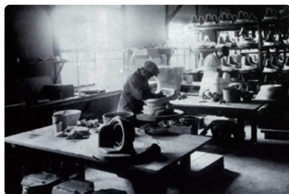
Laboratory established to develop ceramic sanitary ware in 1912

Since our earliest days, TOTO has held the belief that spreading the use of sanitary-related products will promote social development and has proposed the value of cleanliness in living spaces.