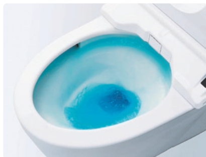
State-of-the-art toilet realizing exceptional water savings

TOTO incorporates various environmentally conscious technologies into our products, including toilets with water-saving methods for clean flushing, showers with ways to wash comfortably using minimal hot water and bathtubs with ways to prevent heated water from cooling. As an example, our state-of-the-art water-saving toilets all boast the feature of using less than or equal to 4.8 liters per flush. These toilets use about one-third the amount of water compared with conventional models in Japan (13 liters per flush), which leads to a significant saving in water consumption based on daily usage. In addition, we are working to spread the use of Hydrotect, our unique photocatalyst technology that purifies the air by removing pollutants (NOx).