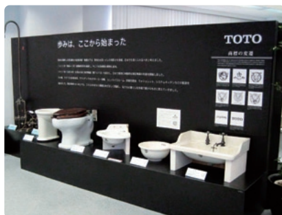
TOTO History Museum

TOTO GALLERY・MA, which is located in Minami Aoyama in Tokyo, specializes in exhibitions on architecture and design. Since opening in 1985, the gallery has conveyed the ideas and philosophies of architects and designers from around the world. The TOTO History Museum within the Company's headquarters premises displays sanitary ware and eating utensils from the Taisho to Showa eras, including the original Washlet. Nearly 60,000 people from around the world have visited the museum to date. It provides an excellent platform to learn about the history of TOTO products.