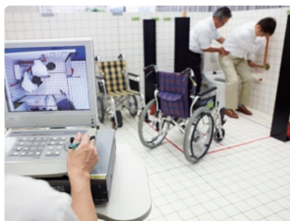
Experiencing what it may be like as an elderly person at the TOTO Universal Design Research Center

The UD concept has been integral to our research and development for over 40 years. UD refers to the design of products that are comfortable and safe to use for everyone, irrespective of differences in age, gender, physical condition, nationality, language, knowledge or experience. The TOTO Universal Design Research Center established in 2006 is working to develop products through repeated dialogue with customer monitors and testing. Since TOTO's products are used daily, it is our job to make them even easier to use and more people friendly.